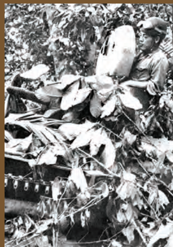
Right: A Japanese Type 97 tankette, camouflaged with leaves, during the invasion of Malaya.

An Allied air attack changed the career of a fanatical ideologue and pathologically brutal staff officer headed for Kokoda.